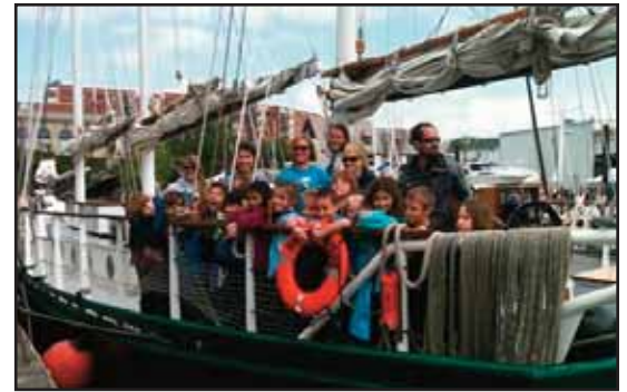
Milton students observed marine life during a schooner trip on the Long Island Sound as part of a science unit.

Second graders at Milton took schooner trips in correlation with their marine science unit, during which each class had the opportunity to tour the Long Island Sound. During their trips, students caught marine life with nets and observed and studied their findings, including trash that pollutes the water, in tanks. They also got to hoist the schooner's sail and sail the vessel in the Sound.