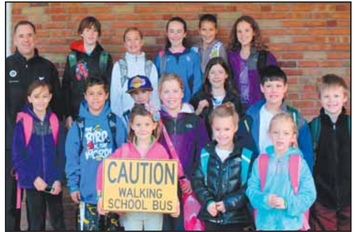
Students and parents from Osborn joined a “Walking School Bus” during “Walk to School Week” in April.

“Walk to School Week,” an initiative launched by the Rye YMCA and Safe Routes to School Committee, was a great success in April. Students from each elementary school participated, joining “Walking School Bus” groups or just walking to school with friends and family. This weeklong event, held in conjunction with Earth Day, helped to promote exercise, reduce traffic congestion around the schools, and protect the environment.