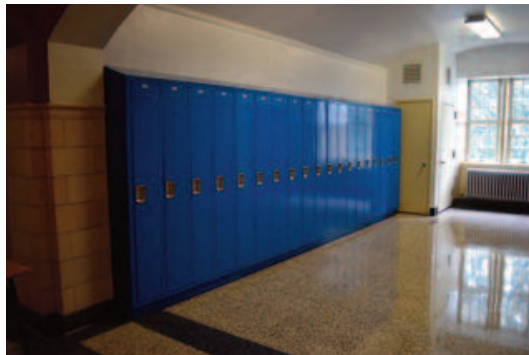
New locker bank in the Middle School