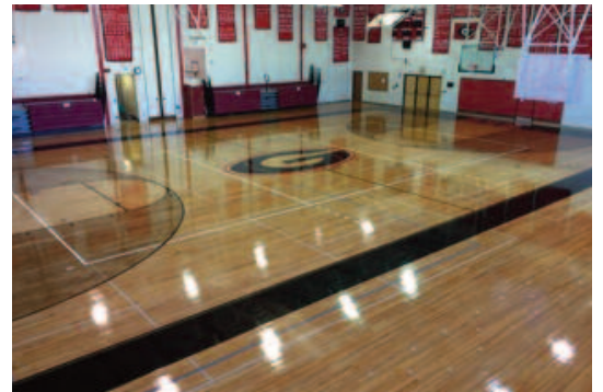
The refurbished High School gym floor