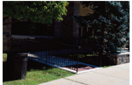
Midland School's new wheelchair ramp