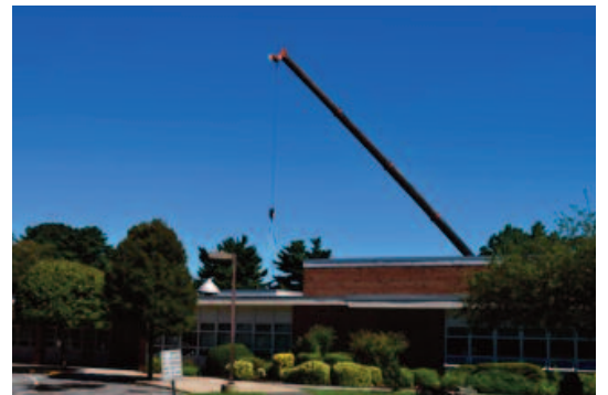
Osborn School's new furnace installation in August