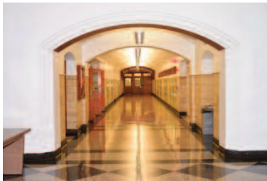
New hallway lighting