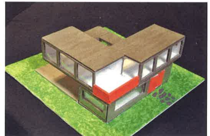
3D: Shipping Container Project